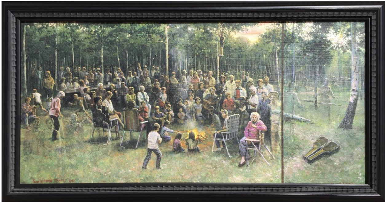
Family Reunion Webster's Flat, up Cedar City Canyon.

| A m E G C | 19. In the multitude of my thoughts within me | F G E A m | Thy comforts delight my soul | A m E G C | 20. Shall the throne of iniquity have fellowship with thee | F G E A m | Which frameth mischief by a law? | A m E A m 21. They gather themselves together against the soul of the righteous | F G E A m | And condemn the innocent blood | A m E A m 22. But the Lord is my defence and my God is the rock of my refuge | F G E A m 23. And he shall bring upon them their own iniquity | A m E G C | And shall cut them off in their own wickedness | F G A m C | Yea, the Lord our God shall cut them off :| 2x. (last time)