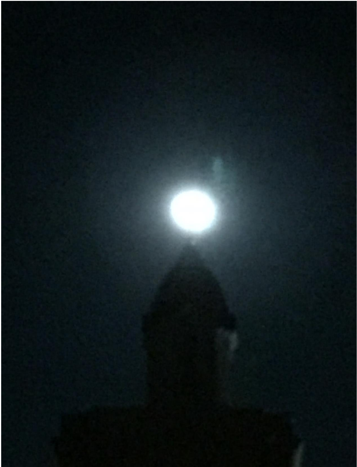
Cedar City Temple at night, 13 November 2016.