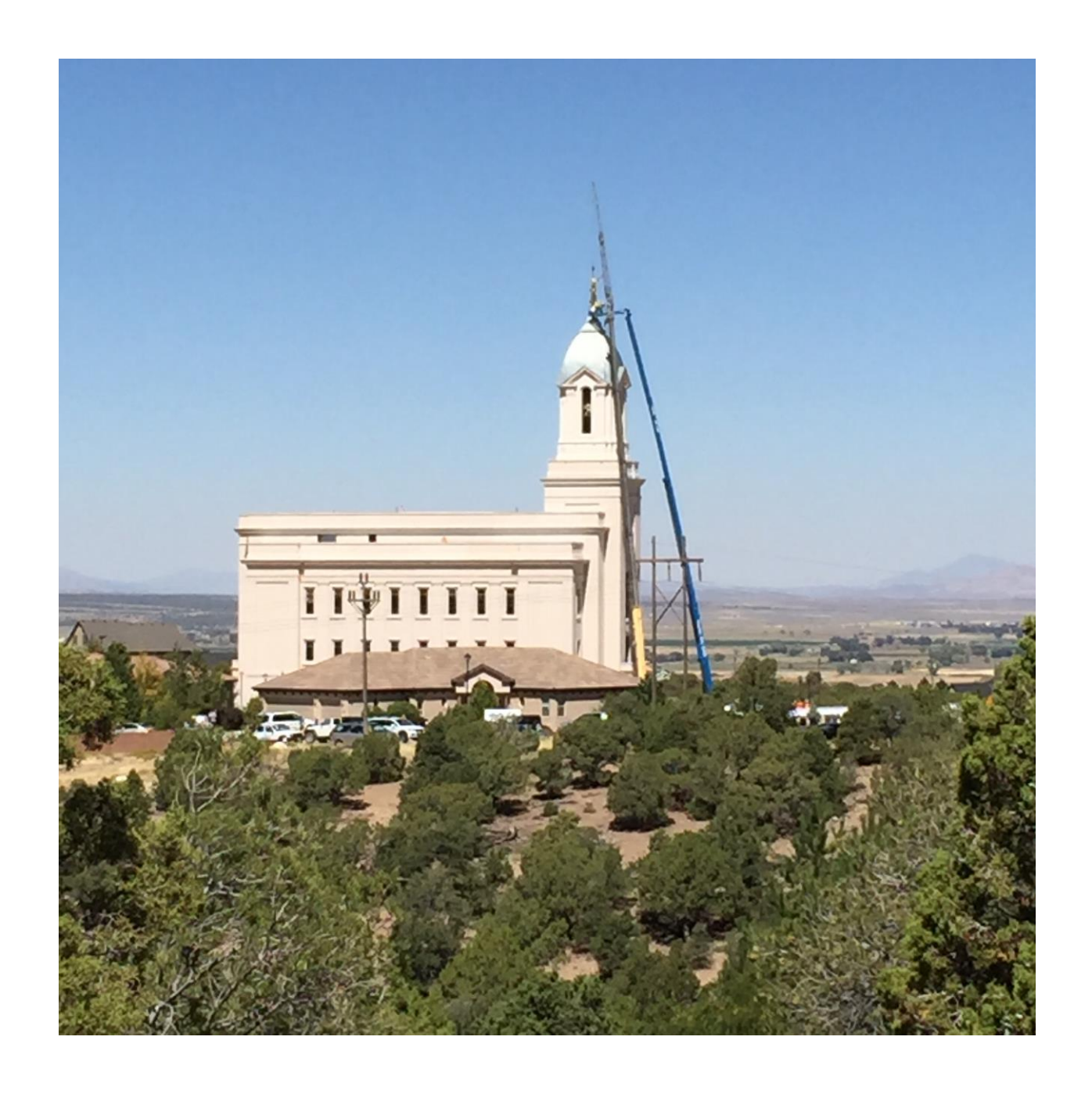
Placing statue of Moroni on the Cedar City Temple, 15 September 2016.