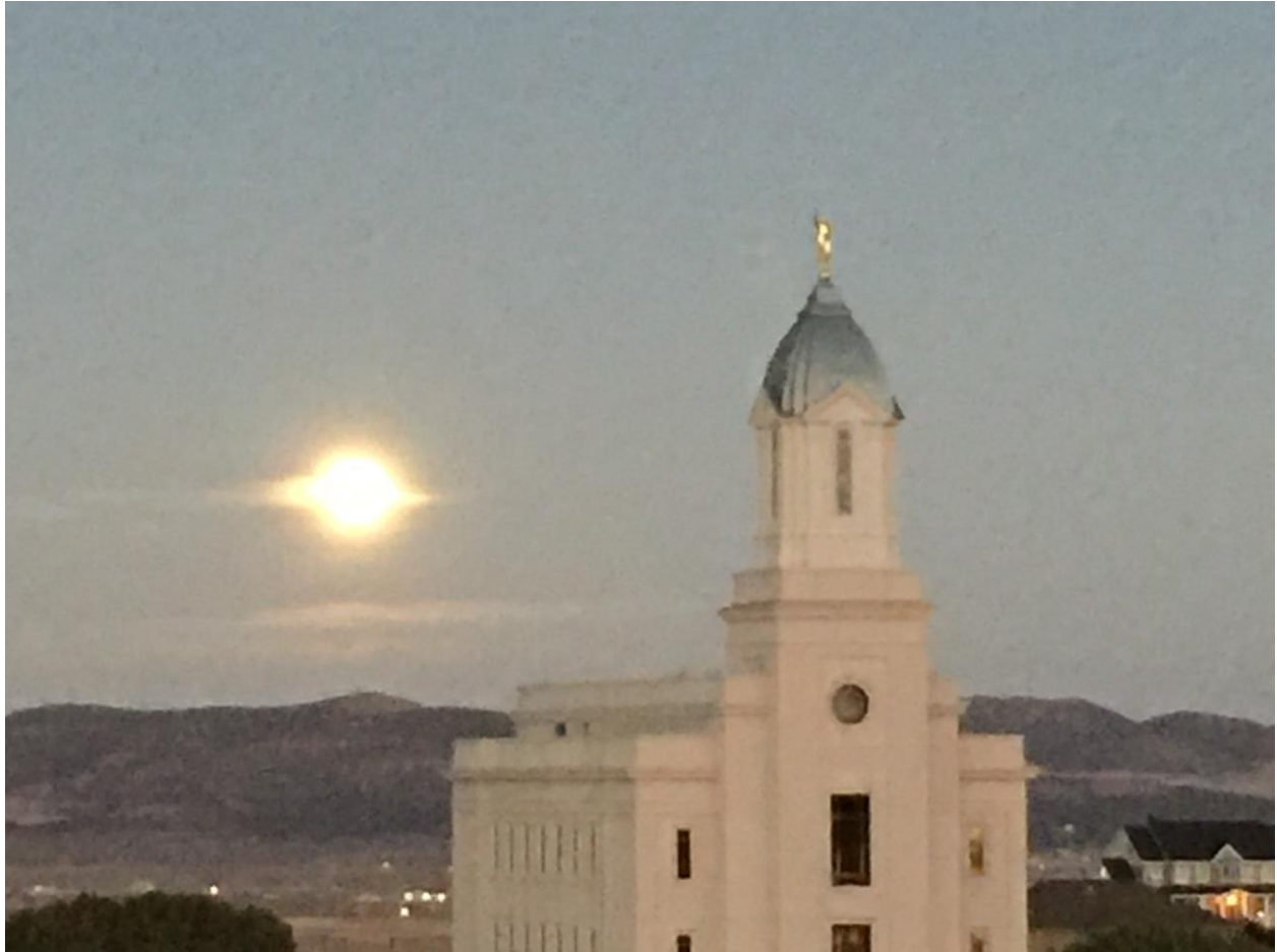
Cedar City Temple 14 November 2016.