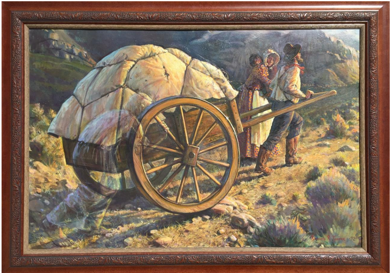
Handcart Pioneers (Bless the Lord at all times Psalm 34:1; The angel of the Lord encamped round about them Psalm 34:7).