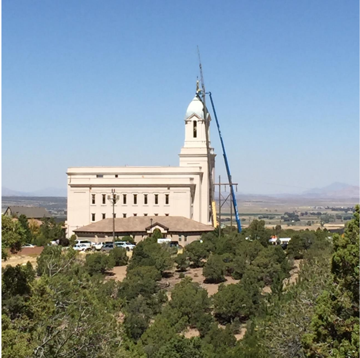
Placing statue of Moroni on the Cedar City Temple, 15 September 2016.